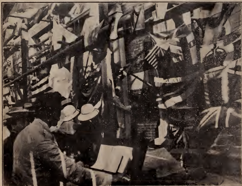
Laying Corner-stone of Bible House.

We foreigners have far more books than are good for us, or than we know how to digest, and I opine we should be loftier minded, happier, and wiser if we turned our backs on much of our ordinary reading and pondered only that matchless book which reveals some new beauty to the sincere student whenever it is opened. The depths of its wisdom have never been sounded, the height of its sublime poetry reach the throne of God. And far far distant be the day, when our Korean Christians shall be gradually led to neglect that book, for any devotional books, no matter how beautiful or orthodox. One goes back to the Bible from all these with a long breath of relief, how much more forcibly, simply and beautifully it says all and more than all they all say, and with what authority